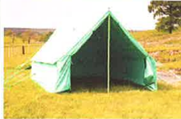
Click image for more info

Blacks of Greenock Stormhaven Tent Ref: 503055